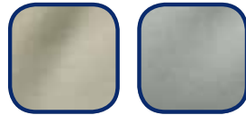
Satin Nickel Plated