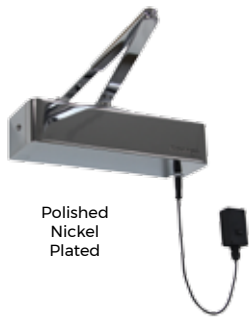
Polished Nickel Plated